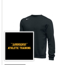
$33.00 Nike Club Fleece Crew Sweatshirt