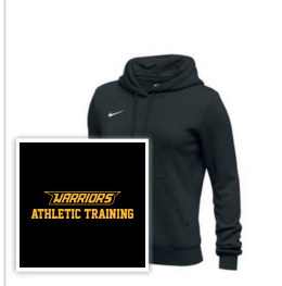
$37.00 Nike Women's Club Fleece Hoody