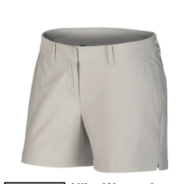
$50.00 Nike Women's Flex 4.5" Woven Short